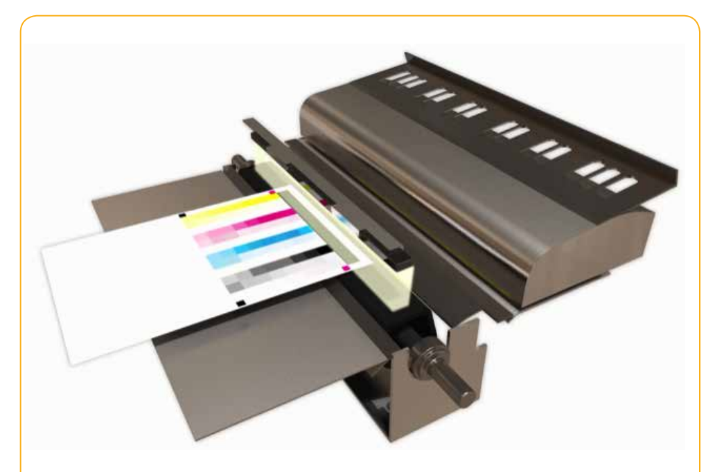
Full Width Array Photo Inline Sensor delivers three functions that automate otherwise time-consuming setup tasks: IOT Color Control, Image to Media Alignment and Color Management via ACQS.

The Versant 2100 Press features the Automated Color Quality Suite (ACQS) with its Full Width Array that gives you more quality and more consistency automatically. It is designed with built-in automation to deliver color accuracy and repeatability while increasing productivity and available press time.