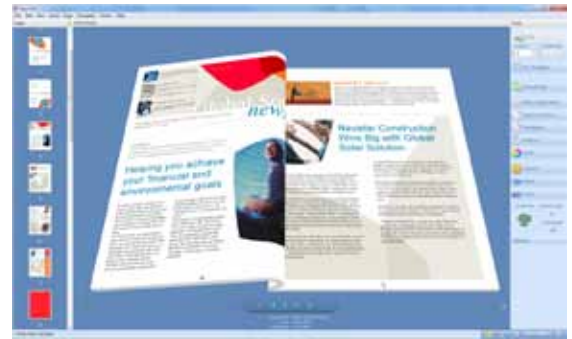
Xerox® Integrated Fiery® Color Server