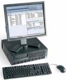
Xerox® FreeFlow® Print Server

Each server is designed to meet a specific set of workflow and application requirements. Your Xerox representative will help you choose the one that best suits your needs.